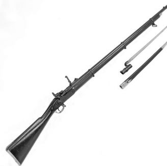
Fig. 3. Snider Enfield rifle (Infantry pattern). The stock is encircled with three iron bands secured by screws. Brass fore-end cap and brass butt plate. The brass

Chichester Harbour. Clearly, the idea was that stray bullets would fall harmlessly into the harbour. Initially the shooting was done with the Snider Enfield rifle (Fig. 3). As time went by, the Snider rifle was replaced with rifles that had a longer range, and the range at Conigar Point had to be abandoned. In 1911, an indoor brick-built rifle range was erected at Potash Road, Havant (near the site of the present-day Wickes store) (Anon., 1982, p.71).