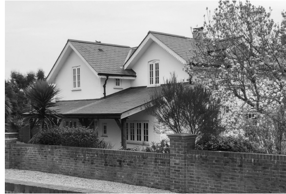
Woodlands Cottage today

Jacqui kindly supplied the photograph of the greengrocery shop in Osborne Road, Southsea 1968.