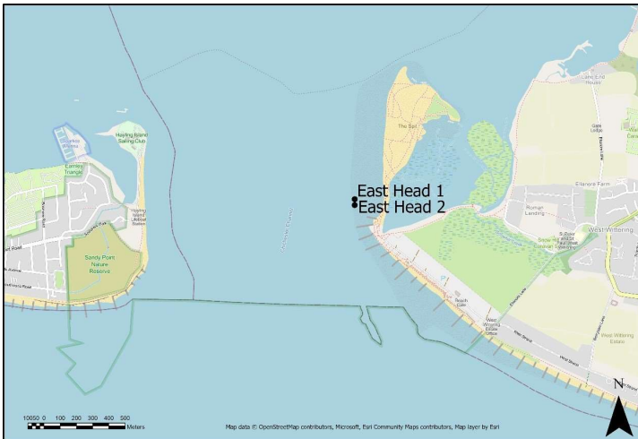
Map showing location of the fish traps in the mouth of Chichester Harbour. Map prepared by Therese Kearns and Sam Griffiths from CITIZAN

Two arms formed of wattle supported by posts and facing northeast, would have trapped fish leaving the harbour as the tide ebbed. The round pond would have retained the trapped fish.