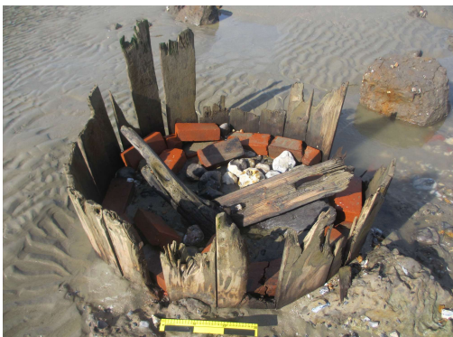
Brick lined barrel well