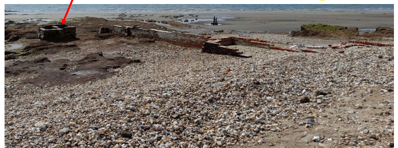
Image showing impact of further erosion.