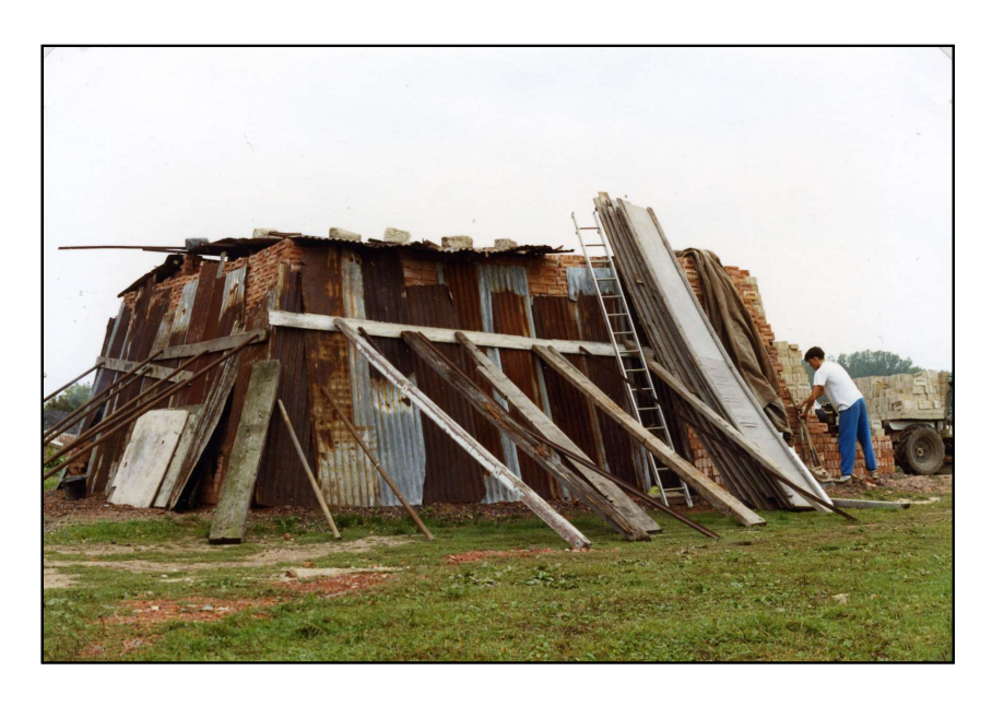
4.6. The finished clamp, covered in corrugated iron and lit, The temperature inside the clamp reaches 1500 C