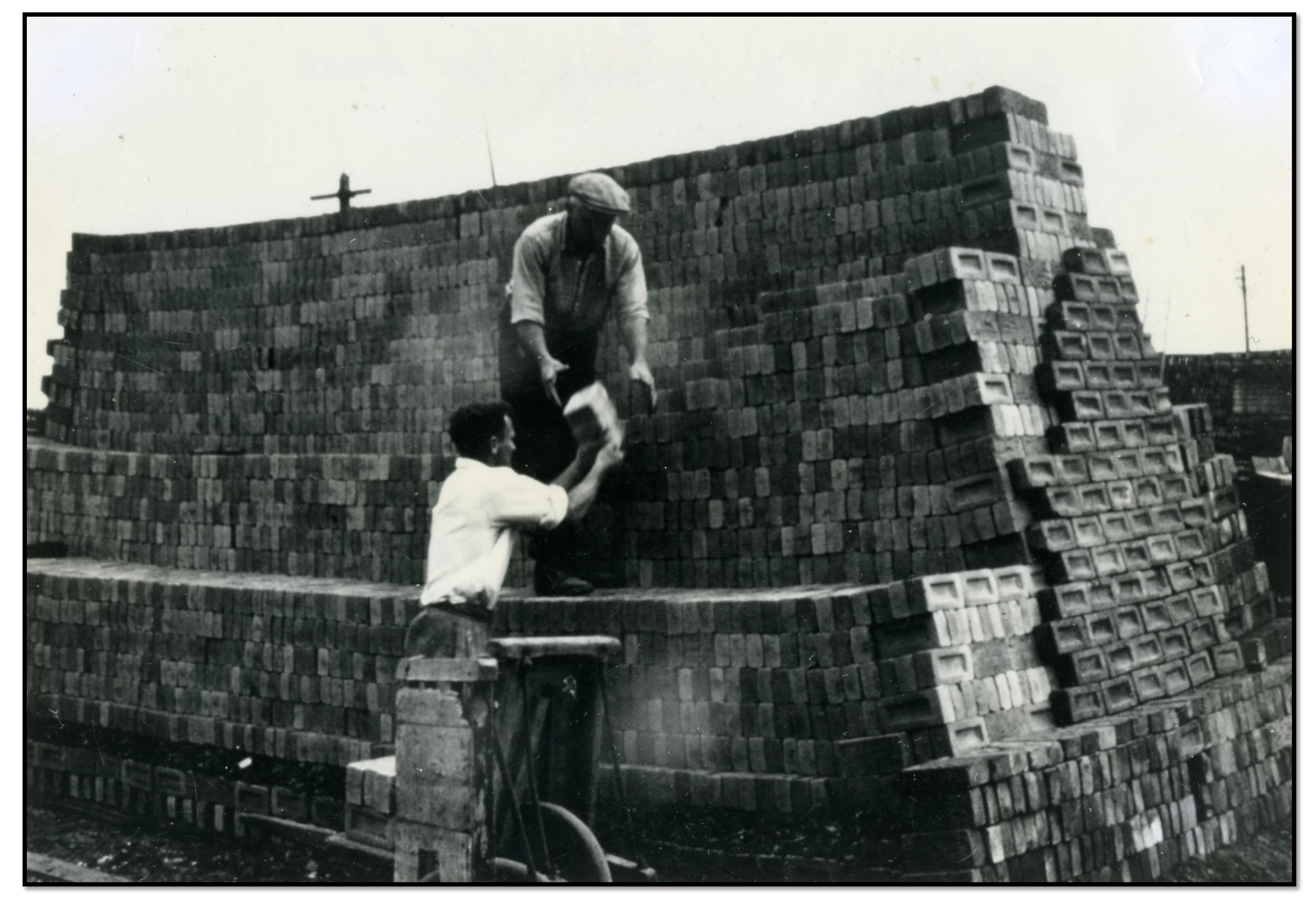
4.4. As the stack of bricks grows, the work becomes more demanding.