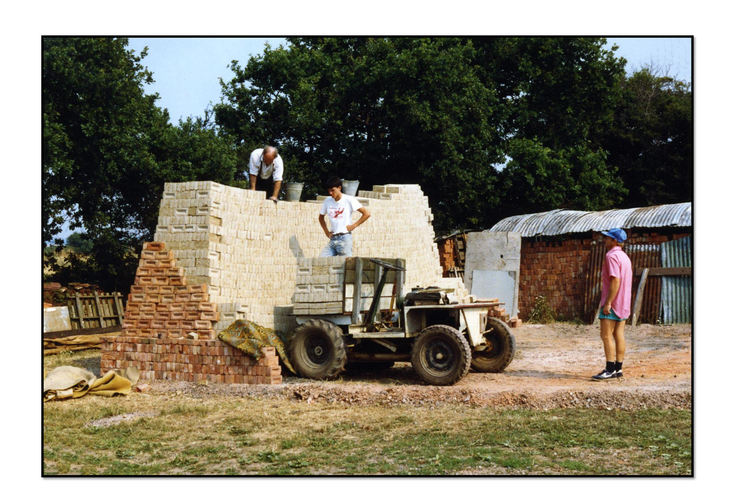
4.3. Bricks are carefully stacked with old bricks on the outside to help keep the heat in and to absorb the moisture. Fuel is built into the clamp as construction progresses.