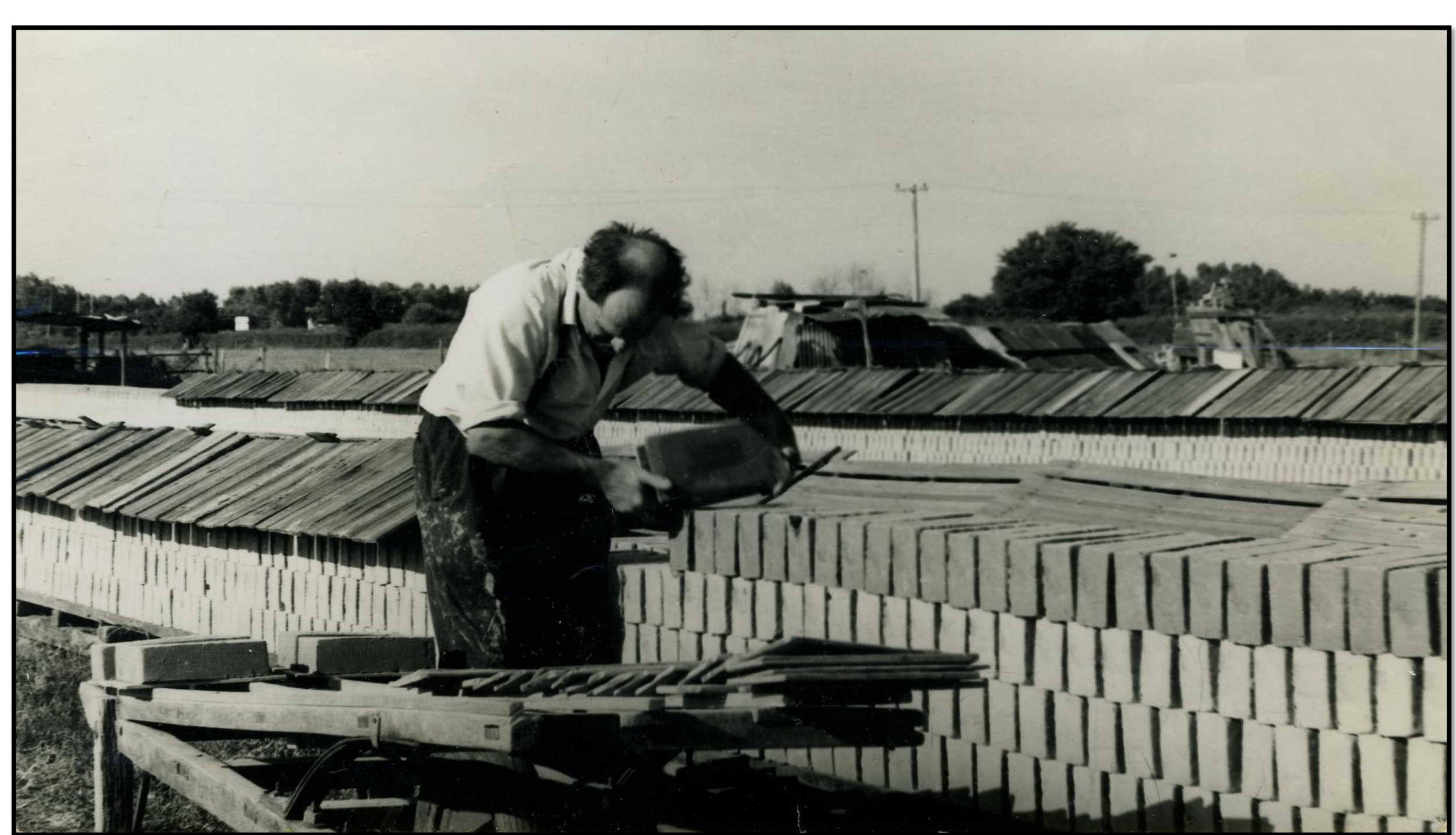
4.2. The newly made bricks are removed from the drying stacks to be built into a clamp.