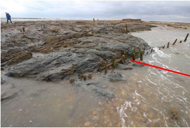
A Line of Posts on Shore