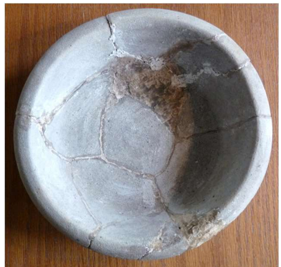
Bowl from Rowlands Castle

The Padre provided 2 cabinets and lighting for the display. The Church can be accessed from the coastal footpath & the collection viewed whenever the church is open, and no service is in progress.